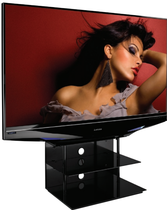
L65-A90 model shown on LFB-65 matching base