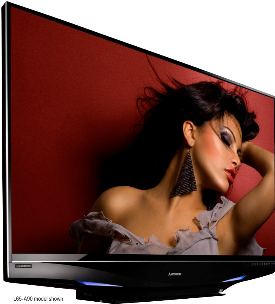
L65-A90 model shown