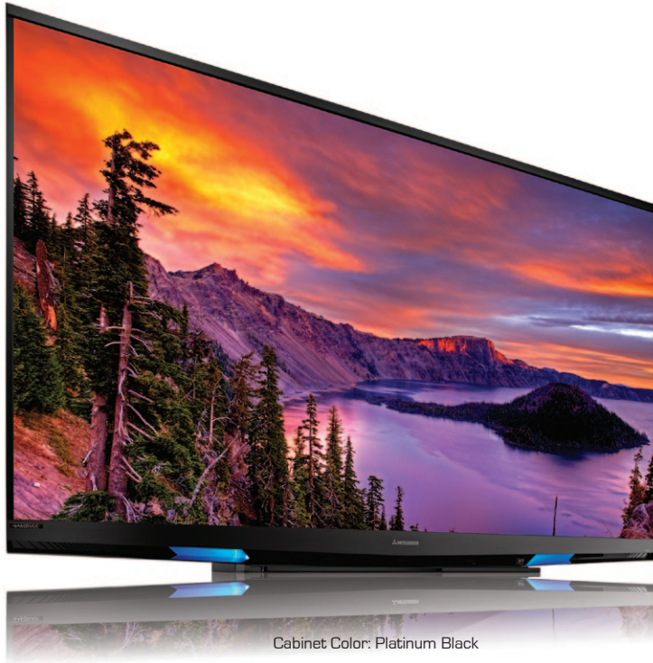
Cabinet Color: Platinum Black

MITSUBISHI ELECTRIC LASERVUE EXPERIENCE CINEMA COLOR