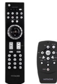
Metallic Finish Multi-Function Remote w/ Glow Keys CLU-4372A Simple Remote CLU-123S