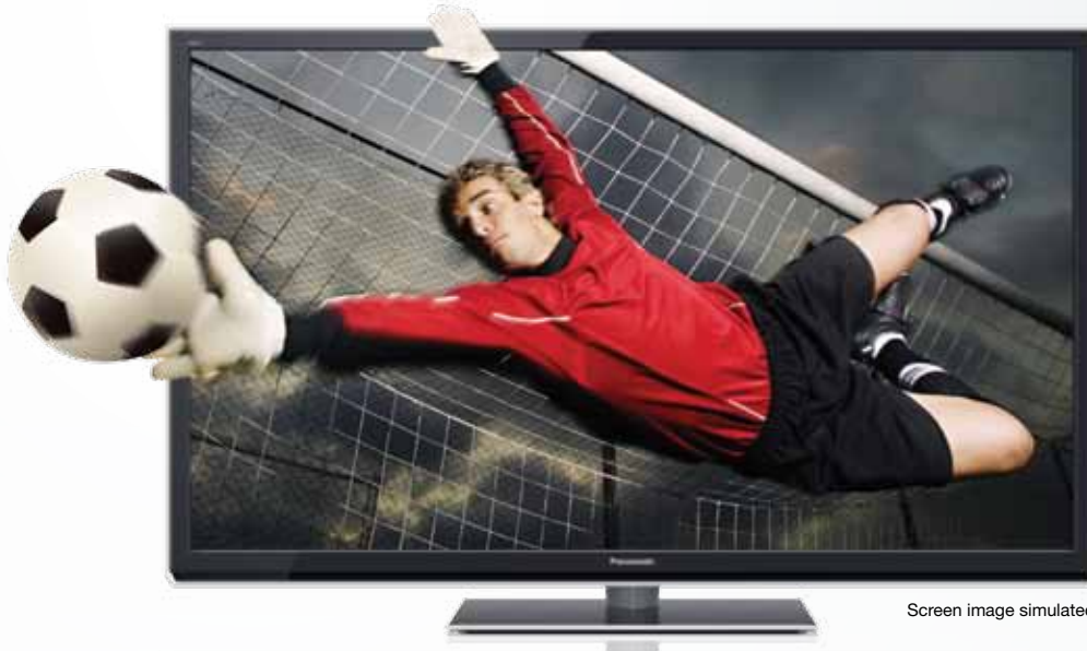
Screen image simulated.