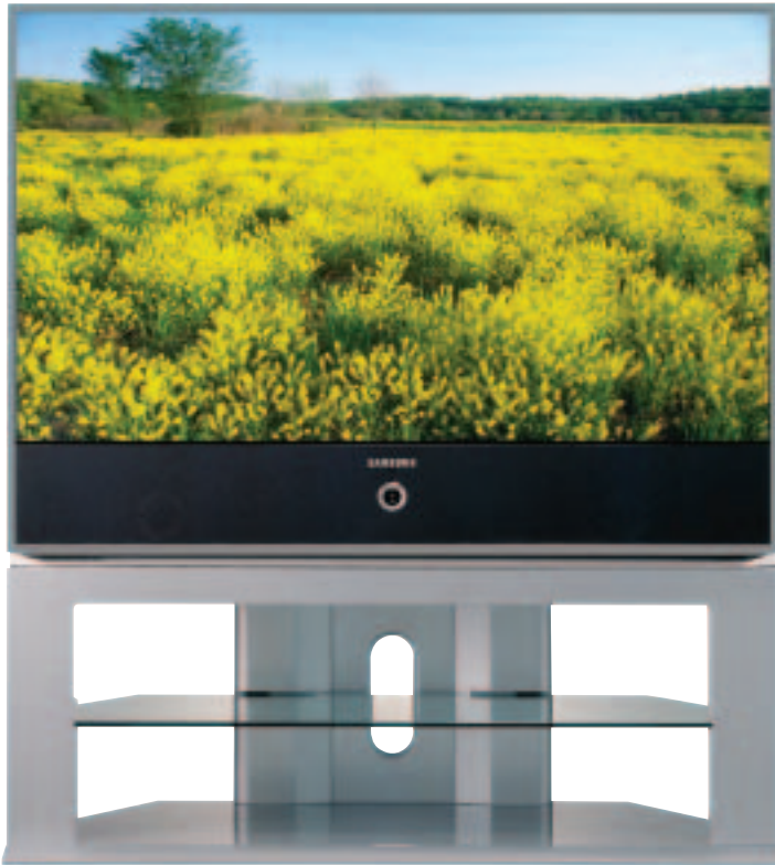
Shown with Optional Stand TR46L5S

46" Widescreen HDTV Monitor Television with DLP™ Technology