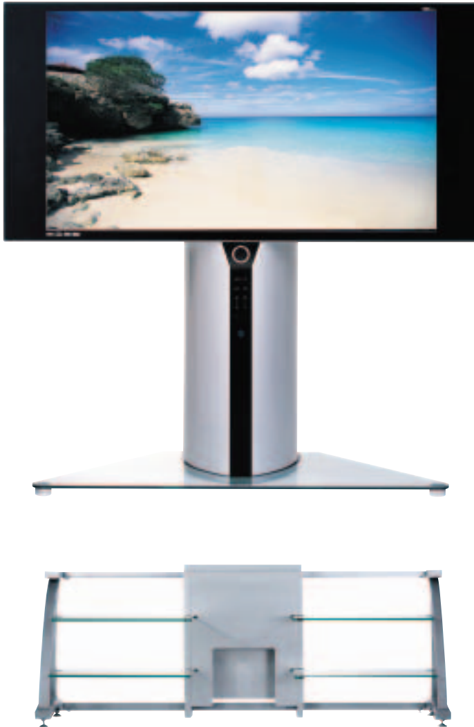
Optional Stand TR85