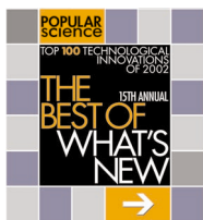
2002 Grand Award Winner