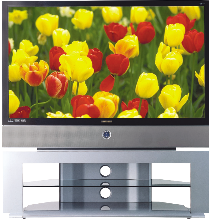
Shown with optional stand (TR61L2S)