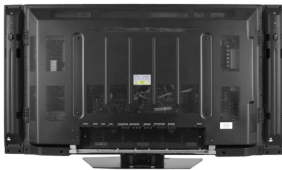
rear view, with speakers