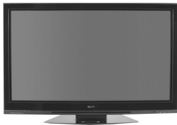
facing view, without speakers