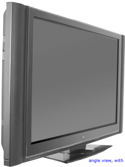
angle view, with speakers attached