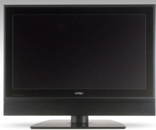
Frontal view, straight on