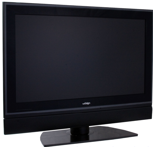
frontal view, with optional speaker and base attached

US headquarters: 2279 North Rampart Boulevard Las Vegas, NV, 89128 (702) 228-7711 visit us at: www.bydsign.com