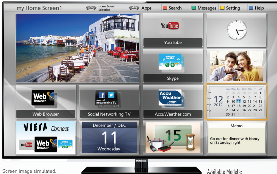
Screen image simulated.

Available Models: TC-L65E60 TC-L50E60 TC-L58E60 TC-L42E60