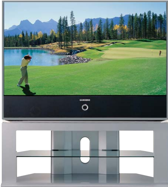
Shown with optional stand.

46" Widescreen HDTV with Digital Cable Ready (DCR) Tuner