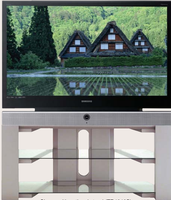
Shown with optional stand (TR4246S)

42" Widescreen DLP® HDTV with 720p Resolution