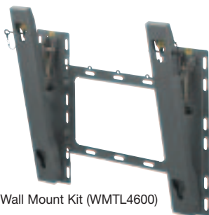
Optional Wall Mount Kit (WMTL4600)