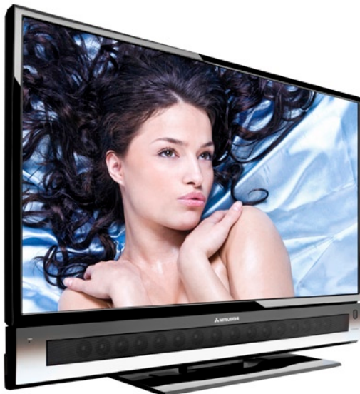
LT-52249 shown on included base