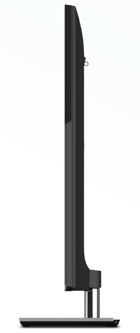
Ultra-slim sophisticated gun metal design, thin bezel and sleek frame stand

Display the small screen content on the big screen quickly and easily