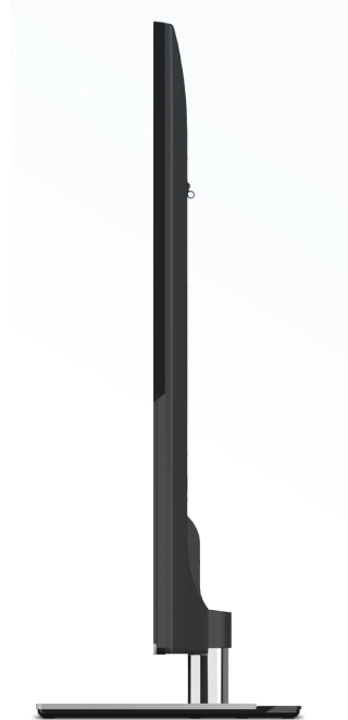
Ultra-slim sophisticated gun metal design, thin bezel and sleek frame stand

Display the small screen content on the big screen quickly and easily