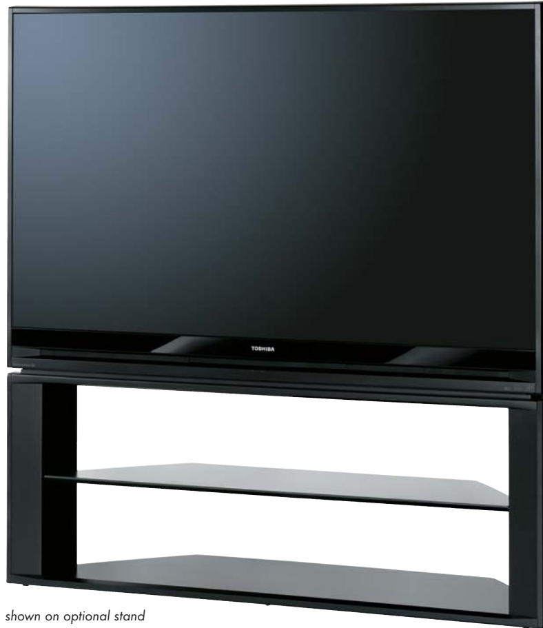
shown on optional stand

1080p Full HD Display - With Full HD, there's no need to scale down a 1080 signal. With twice the pixel resolution of 720p HD models, Full HD creates the pinnacle in picture quality.