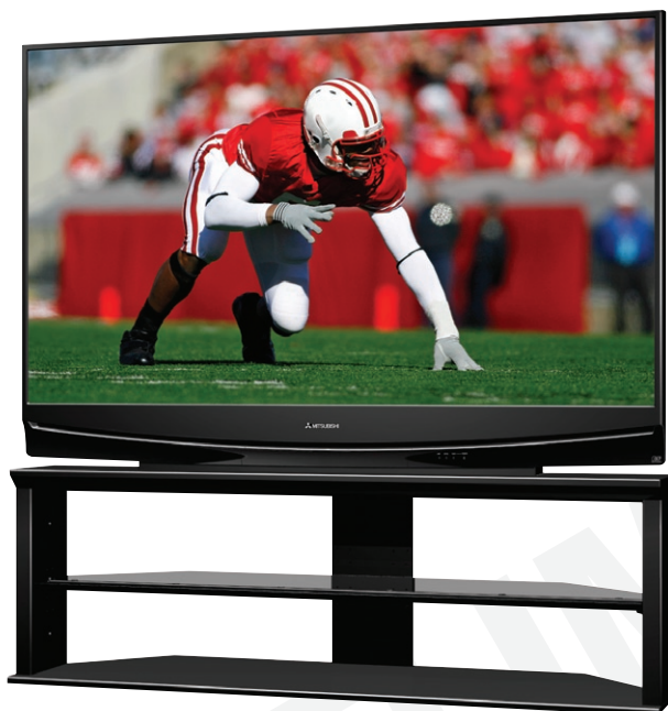
WD-65736 Shown on Optional Base (MB-S60/65 or MB-S73 for 73" model)