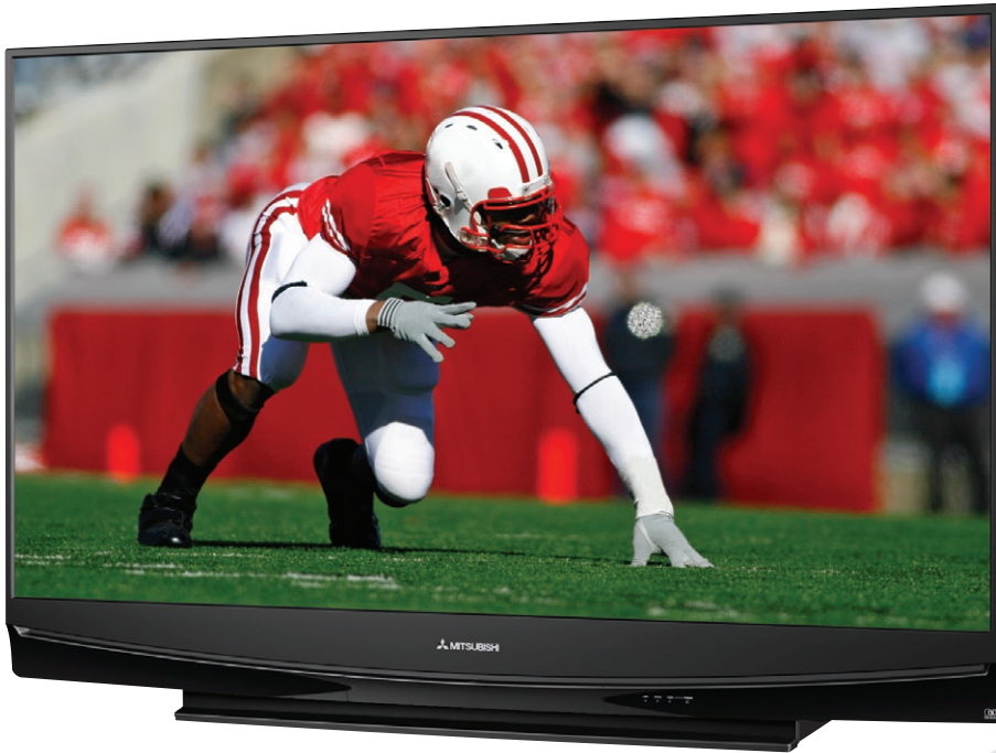
WD-65736 Shown Cabinet Color: Platinum Black Accent: High Gloss Black

Live your entertainment, don't just watch it.