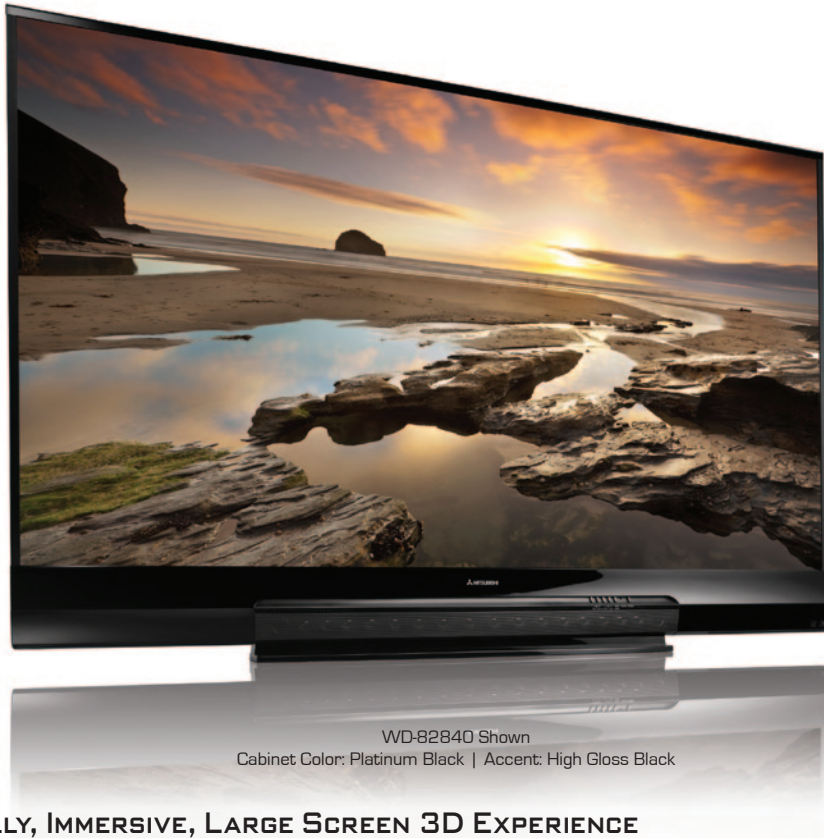
WD-82840 Shown Cabinet Color: Platinum Black | Accent: High Gloss Black