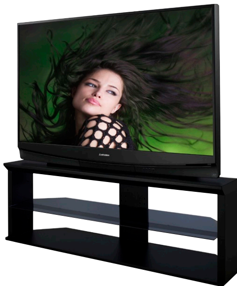
WD-60C9 Shown on Optional Base MB-S60/65A