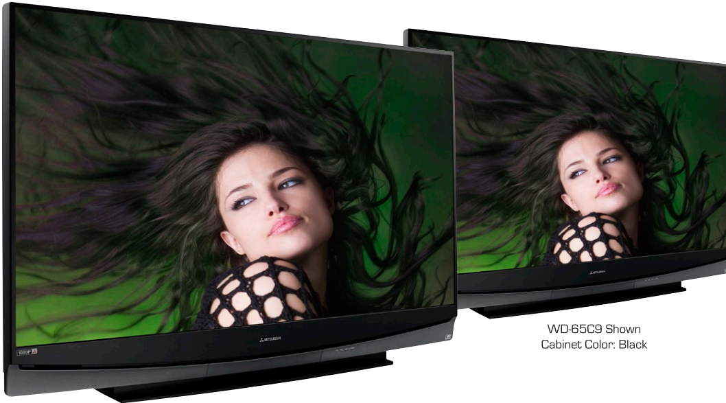
WD-73C9 Shown Cabinet Color: Black