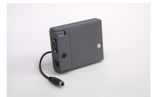
Optional PJ-Net (POA-LN01)