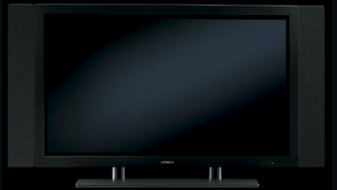
CMP4211 with optional matching stand (CMPAD05B) and optional side-mounted speakers (CMPAS14W).