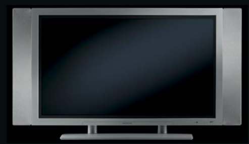
CMP4212 with optional matching stand (CMPAD05S) and optional side-mounted speakers (CMPAS14V).