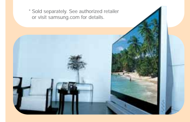
1080p HD Format