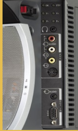
Right-hand side port connectivity