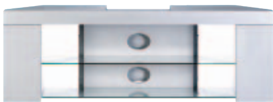
Optional Stand TR63