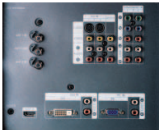
Rear Jack Panel

For more information on digital TV technology please visit www.samsungusa.com/dtvguide