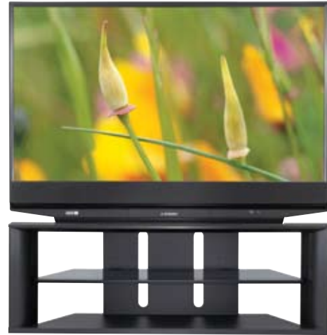
WD-Y57 Shown on Optional Matching Base (MB-57GB)**