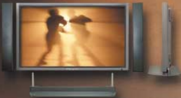
CHAMPION 42CVI SHOWN WITH OPTIONAL SPEAKERS AND STAND