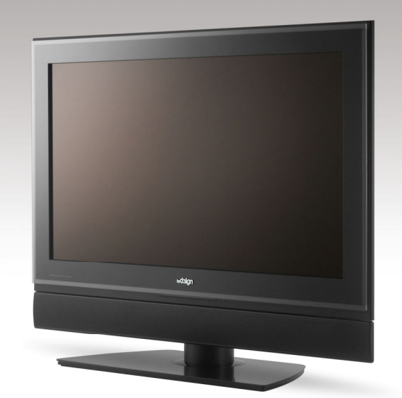
frontal view, with speakers attached