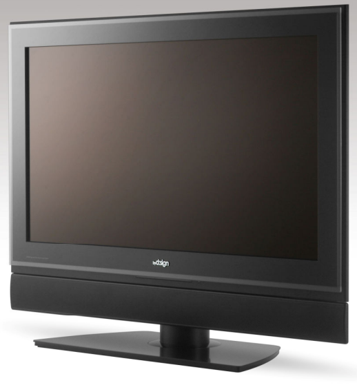
frontal view, with speakers attached