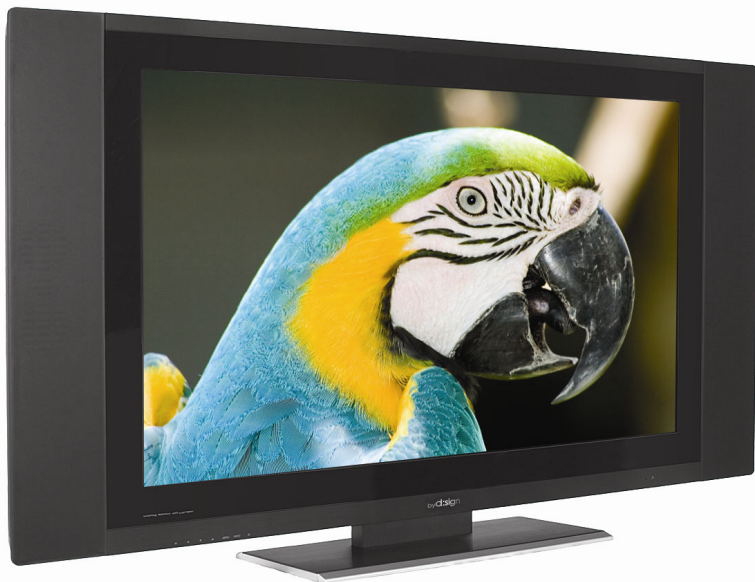
angle view, with speakers attached

US headquarters 2279 North Rampart Boulevard Las Vegas, NV. 89128 (702) 228-7711 visit us at: www.bydsign.com