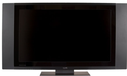
Frontal view, with speakers