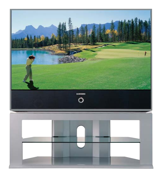
Shown with optional stand.