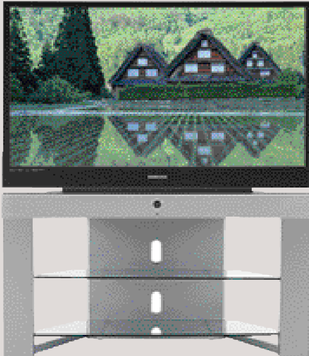
Shown with optional stand (TR4246S)

46" Widescreen DLP® HDTV with 720p Resolution