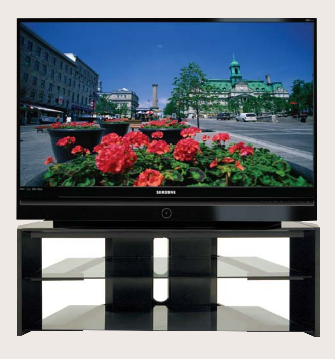
Shown with optional stand (TR50X3B)

56" Widescreen DLP® HDTV with 1080p Resolution