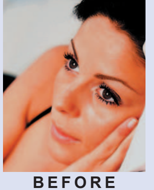
The Digital Noise Reduction Program can detect and obviously remove any digital noise from a digital program or a DVD movie. The image then becomes cleaner and more realistic.

The Automatic Edge Corrector is able to seperate High Definition TV programs or DVD signals into their components. After applying an «edge correction», the boundaries of people or objects become smoother, producing a clear and clean image.