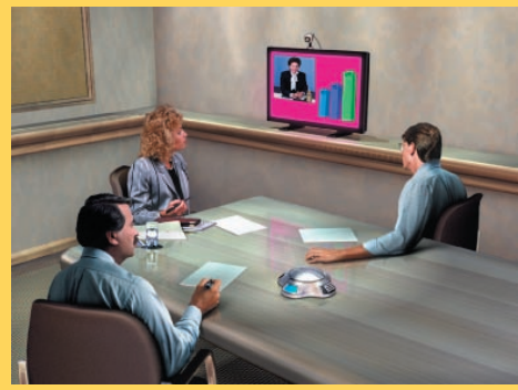
Corporate. Deliver a presentation they'll remember using MultiSync Large-Screen LCDs. Ideal for board rooms, conference rooms and large offices, the monitors' ability to display crystal-clear text and precise images add clarity and impact to spreadsheets, documents and graphics-based presentations. Picture-in-picture and 50/50 split-screen capabilities allows your group to simultaneously view multiple applications, such as a spreadsheet and full-motion video conference.