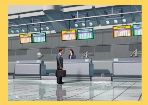
Information Display. Make a lasting impression on the public eye with MultiSync Large-Screen LCDs. Whether the displays are placed in airports, train stations, restaurants or kiosks—in any interior environment, their spacious screens are guaranteed to turn heads and feed useful information to passersby. With XtraView wide-angle viewing technology, it doesn't matter if they're directly in front of the screen or walking by–an ideal view is assured.

With space conservation a major concern for all types of markets in today's business world, the LCD4610, LCD4010 and LCD3210's space-conscious design allow them to fit comfortably into almost any application for maximum impact to viewers. Wall mounting, custom-made cabinets and hanging fixtures are just a few of the installation options you have with these displays.