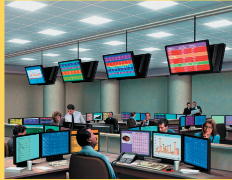
Financial. In the fast-paced financial market, information needs to be relayed in real time. MultiSync Large-Screen LCDs are capable not only of displaying on-thefly market data and other vital information without ghosting or blurring, but do so displaying crisp text and utilizing a high-bright backlight for easier readability.