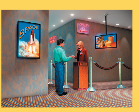
Advertising. With their high resolution, bright display and lifelike colors, MultiSync Large-Screen LCDs are unrivaled in drawing consumer attention. Spread the word on your products and services to moviegoers, advertise the latest sale items at a department store or attract the eyes of storefront passersby. No matter the outlet, these displays stop consumers in their tracks.