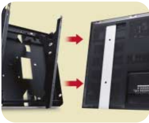
Put more visual flair into any viewing environment with the optional wall or ceiling mount.