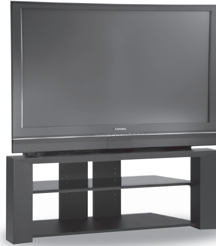
WD-52628 Shown on Optional Matching Base